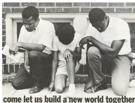
John Lewis 2